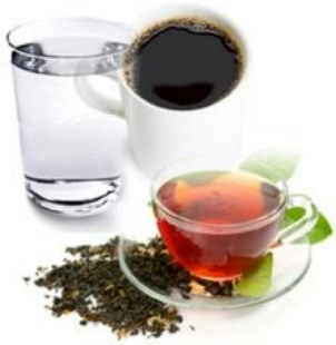
Coffee, Tea, Water in our waiting area